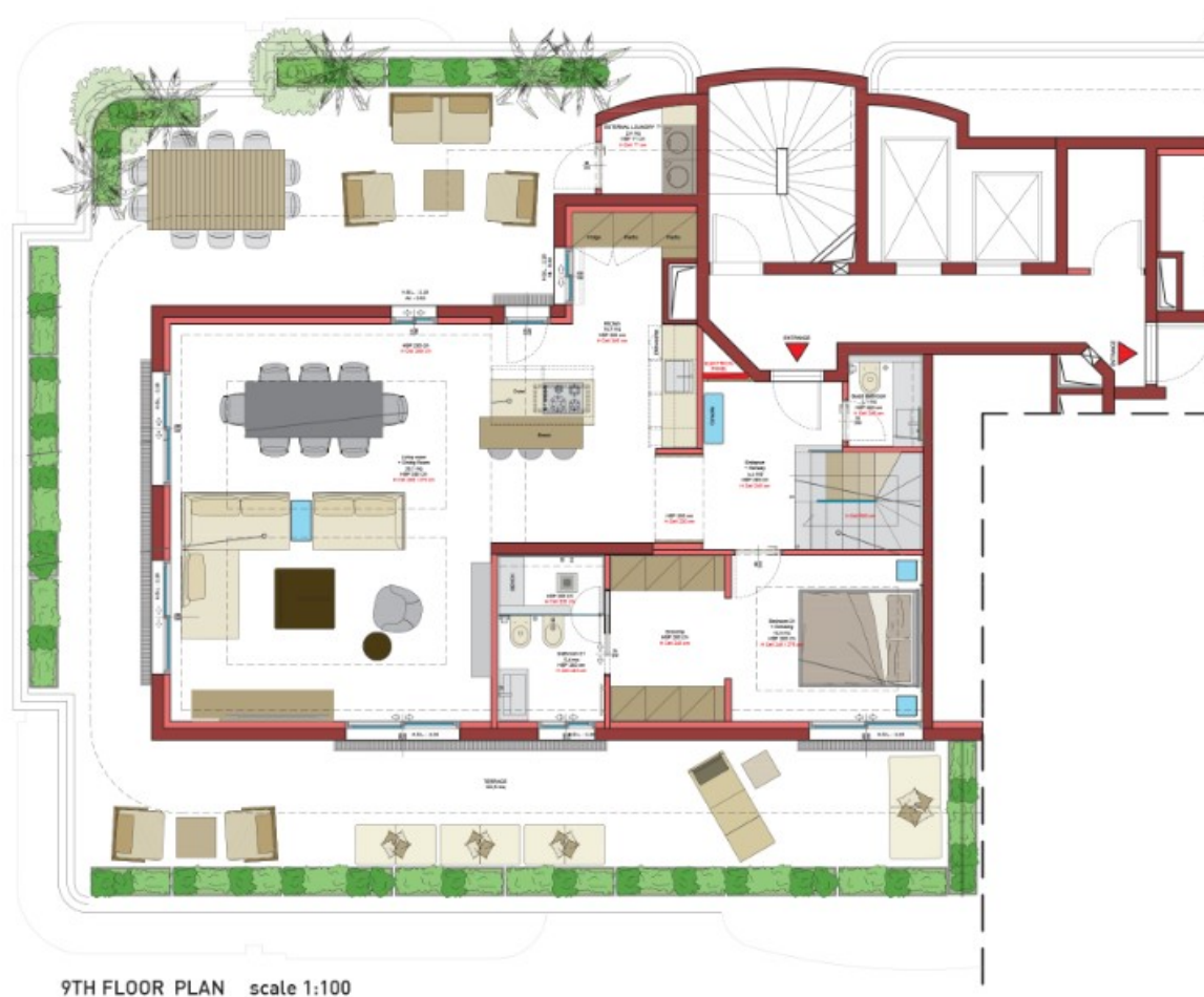
9TH FLOOR PLAN scale 1:100