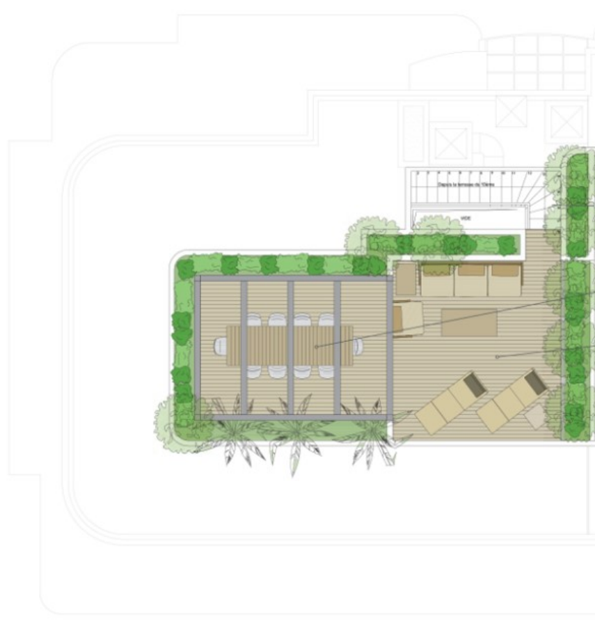
11TH FLOOR PLAN scale 1:100